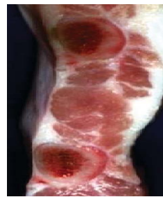
Pork meat analysis