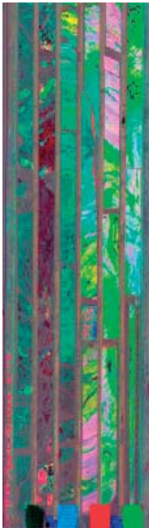
Geologically classified SWIR image of a drill core tray. Image collected in a high speed mode with 2 mm resolution. Tray size 132 x 40 cm, image size 1 050 x 320 pixels.

SisuROCK is a fully automated hyperspectral imaging instrument for easy, high speed scanning of drill cores and other geological samples. It is capable of imaging a single drill core in a high resolution mode or a whole core box in a high speed scanning mode. Hyperspectral imaging data of a whole core box is acquired in less than 15 s, highly improving productivity in drill core analysis.