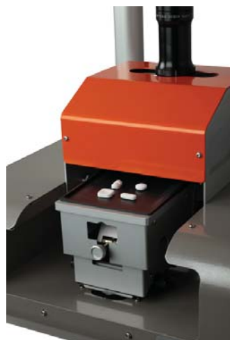
Picture 2. A sample tray holding cheese granules has been loaded into sisuCHEMA, here fitted with a macro lens, which images the samples at 30 micron resolution.