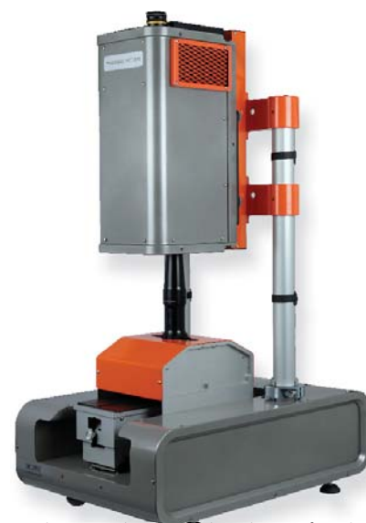
Picture 1. SisuCHEMA imaging workstation

SisuCHEMA comes with various sample trays that can be loaded into the instrument while containing dairy samples (picture 2). SisuCHEMA's push-broom technology along with all its advantages provides a rapid measuring procedure, a pre-requisite for keeping the often moist and fresh dairy samples unimpaired. The recorded hyperspectral images are then easily transferred to the analysis software Evince, where chemical composition and its distribution can be analyzed and viewed with various types of visualizations (picture 3).