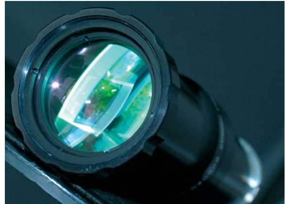
OLESMacro hyperspectral fore lens

Hyperspectral fore optics can be provided from 400 nm to 12000 nm. Multiple point fiber optics is available from 200 nm to 2500 nm.