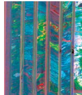
Drill core analysis