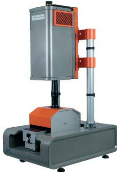
SisuCHEMA chemical imaging workstation