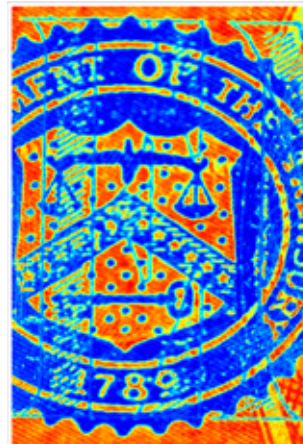
Hyperspectral image of currency