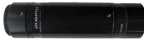
High magnification precise eye lens