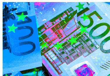
UV Image of currency

The UV camera is currently offered as an uncased model and comes with the frame grabber, cables and full wavelength and non-uniformity calibrations. This UV camera can be used for many applications where the UV spectral region is of interest, including forensics, semiconductors, biomedical and other applications.